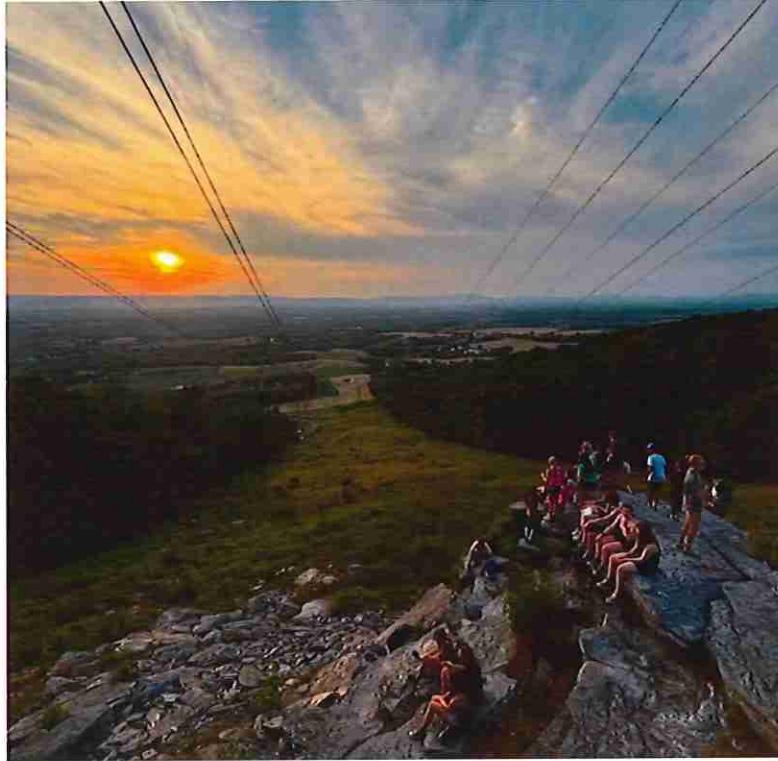
Sunset from Shock Rock

"I thank God each time I remember you." Philippians 1:3