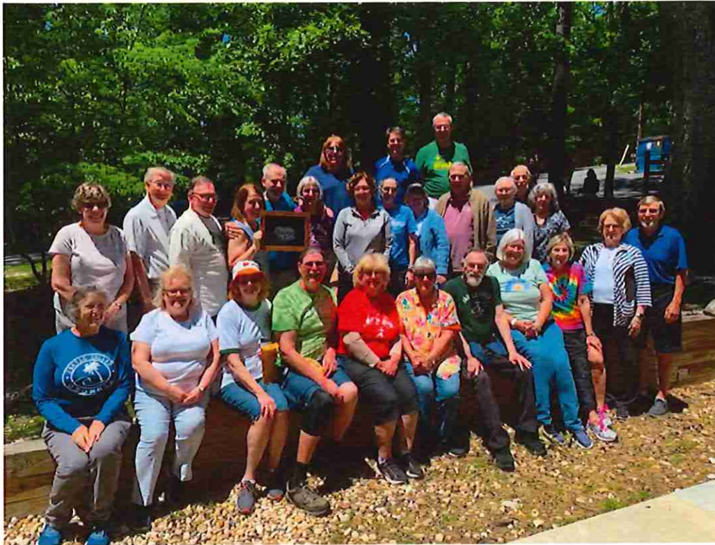
Friends from the 60s and 70s enjoying the 65 th anniversary